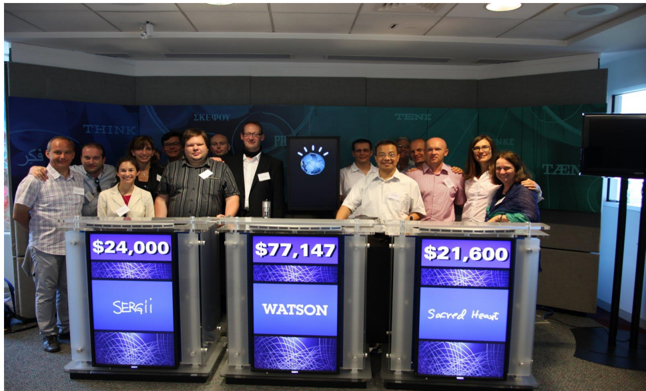
'Watson' Challenge at IBM – July 2012