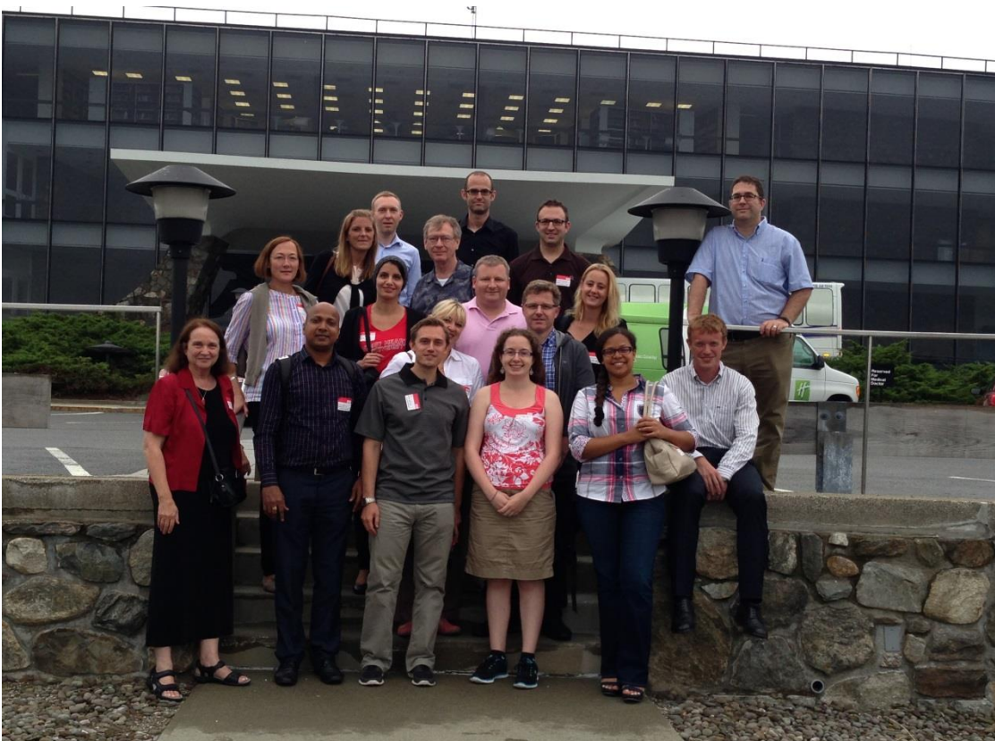
With our hosts at IBM – July 2014