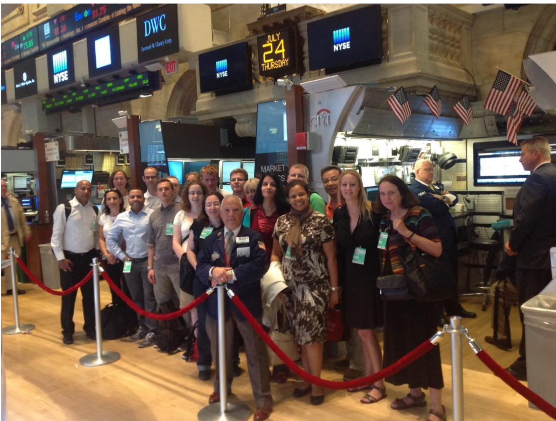
On the floor of the New York Stock Exchange – July 2014